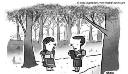
“OK, went to maps, clicked 'home,' and specified walking directions. We're good to go.”