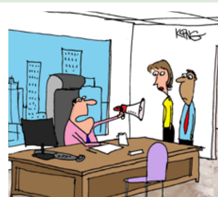
“My e-mail is down, so if you need to communicate with me, use this.”