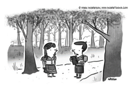
OK, went to maps, clicked 'home,' and specified walking directions. We're good to go."